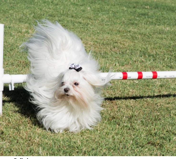
Clover - Rally jump