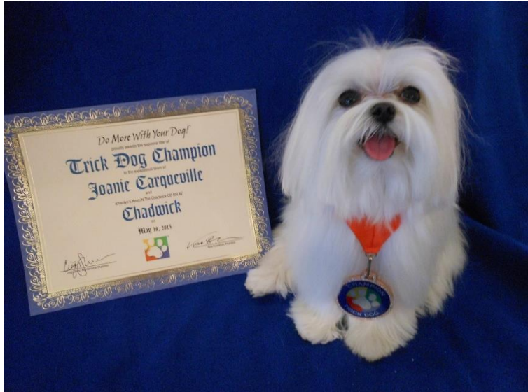
Chadwick- 1<sup>st</sup> Maltese Trick Dog Champion - TDCH

The Trick title allows the dog owner a choice of behaviors in each category enabling the owner to play to the strengths of his particular breed/dog. There are five title levels, Novice Trick Dog (NTD), Intermediate Trick Dog