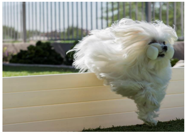
Chadwick – Obedience - High Jump

The AMA has witnessed this interest with the increase in Obedience and Rally entries. At the annual board meeting in 2010, the Board unanimously approved to offer Rally