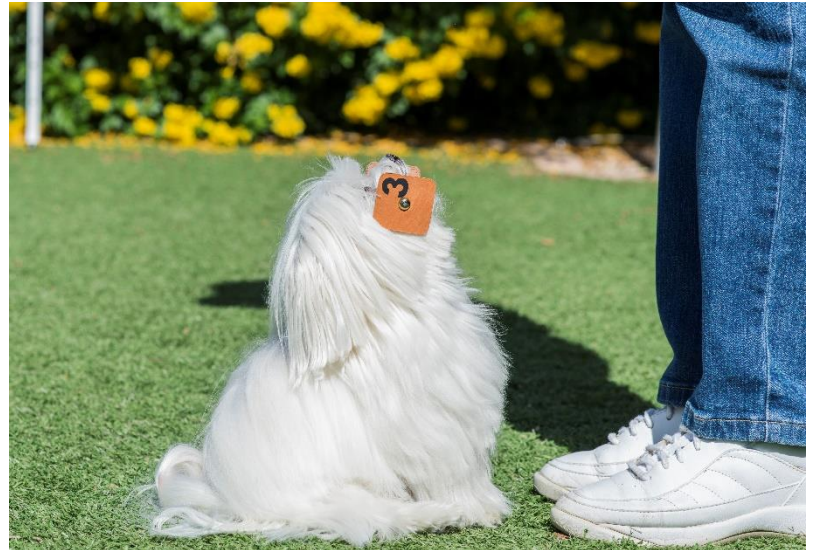
Chadwick - Obedience - leather articles

Companion events showcase the dog working with the handler in activities that might be performed in a regular house hold setting. The dogs and handlers train for each event and each